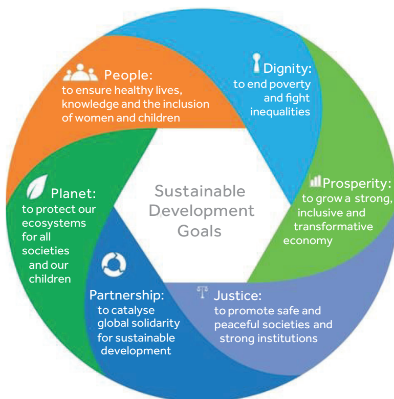
Figure 1.3 Clustering of SDGs according to six essential elements (UN General Assembly 2014)

The crucial role of education in achieving sustainable development was initially stressed at the UN Conference on Environment and Development, held in Rio de Janeiro in 1992, through Chapter 36 of its outcome document entitled Agenda 21 (UN Conference on Environment and Development 1992). The role of education for sustainable development was also emphasised in paragraph 233