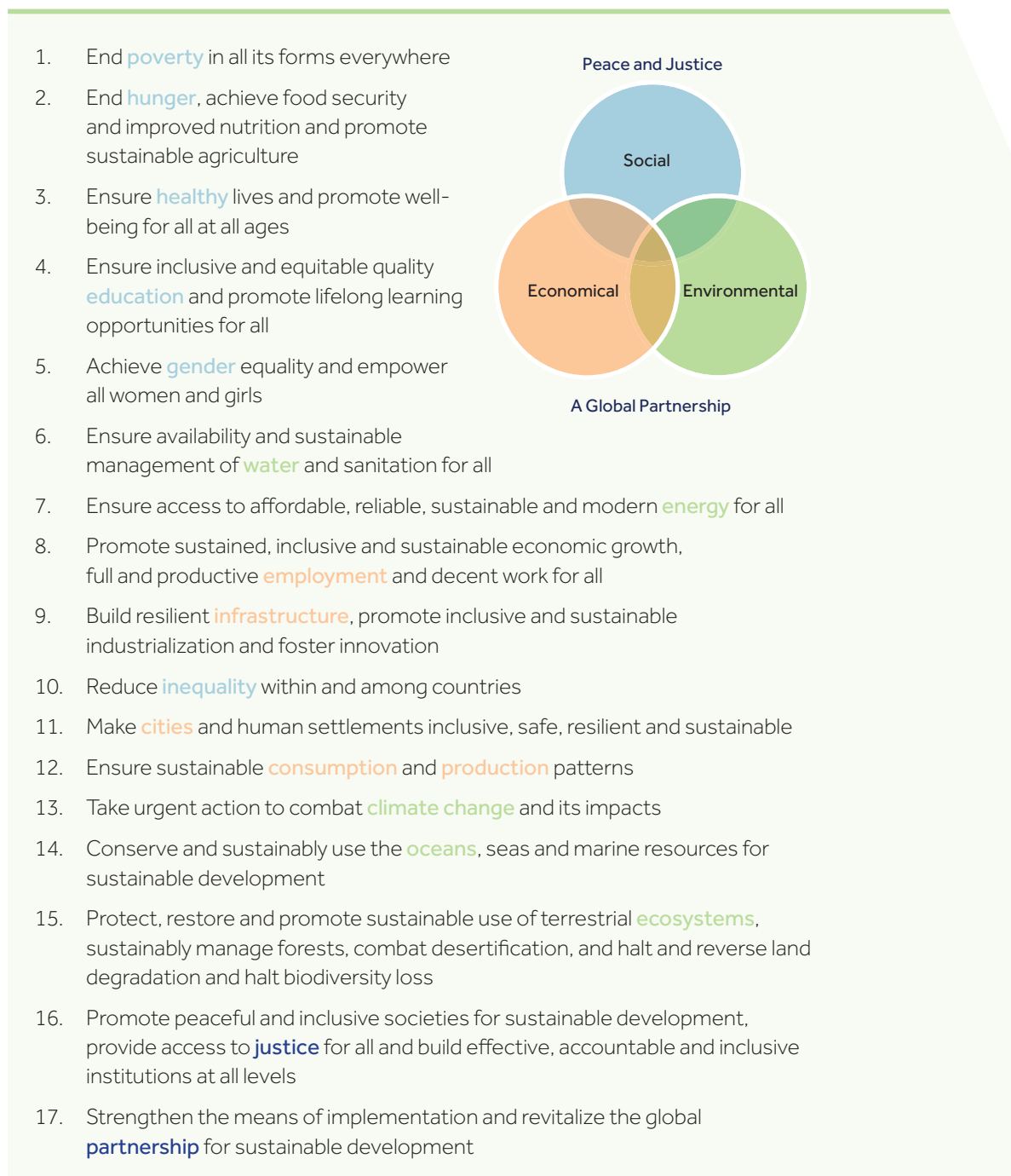
Figure 1.2 Overarching elements of the SDGs (2015–2030) (Health and Education Unit of the Commonwealth Secretariat [HEU] 2016)

In the synthesis report, the UN Secretary-General (UN General Assembly 2014) notes 'in particular, the possibility of maintaining the 17 goals and rearranging them in a focused and concise manner that enables the necessary global awareness and implementation at the country level', as well as providing some conceptual guidance.